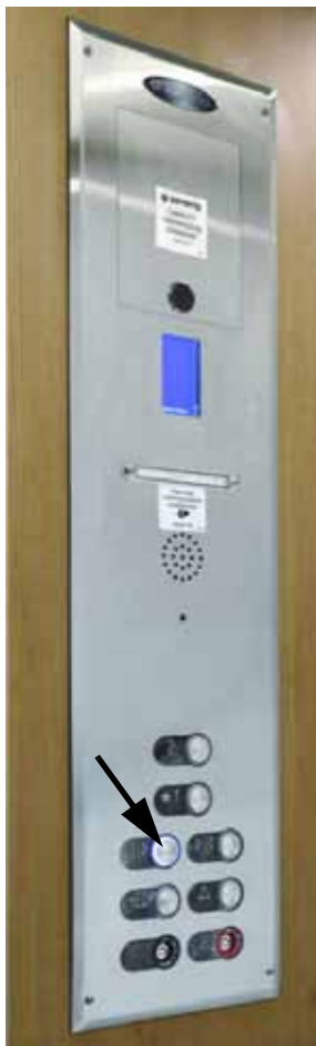
Figure 3 Door Open Button

When the elevator is at a landing level, the doors can be opened by pressing the Door Open button. Normally the doors will have opened and already closed automatically. The Door Open button allows the door to be reopened.