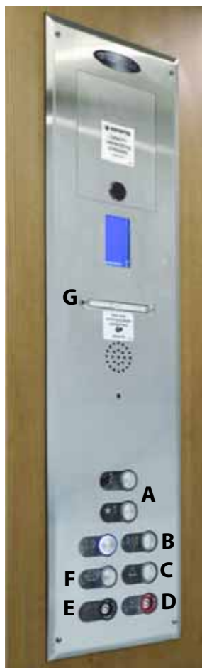
Figure 1 Keyed COP

This button can be pressed at any time to activate the optional hands-free phone in case of an emergency. The red light above the speaker will come on when two-way communication has been established. For units that have a standard hand-held phone, it is located in a separate phone cabinet in the cab.