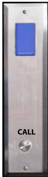
Figure 2 Hall Call Station

In the event of a building power failure, the door system is provided with a temporary power back-up system to continue the opening operation for a number of times. On resuming normal building power, the back-up system will turn OFF and begin automatically recharging.