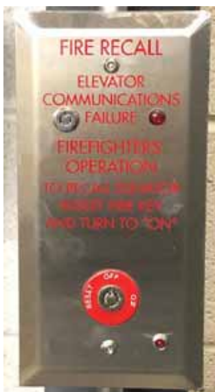
Figure 3 Phone Monitor

NOTE: There is an alarm silence key provided to turn off the beeper.