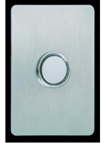
Figure 2 Hall Call Station

In the event of a building power failure, the door/gate system includes a temporary power back-up system to allow the elevator to run down to the next available landing, or to the 1st floor landing. The lift cannot run up on battery power. Upon resuming normal building power, the back-up system turns OFF and automatically recharges.