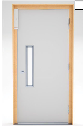
Flat Vision Panel