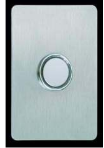
Figure 2 Hall Call Station

The Landing Door/Gate lock prevents cab movement unless the door/gate is in the shut position with the lock in place. If the door/gate is not completely shut, the cab does not move.