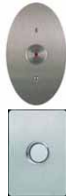
Figure 3: Hall Call

The Landing Door/Gate lock prevents the movement of the cab unless the door/gate is in the closed and locked position. If the door/gate is not completely closed, the cab will not move.