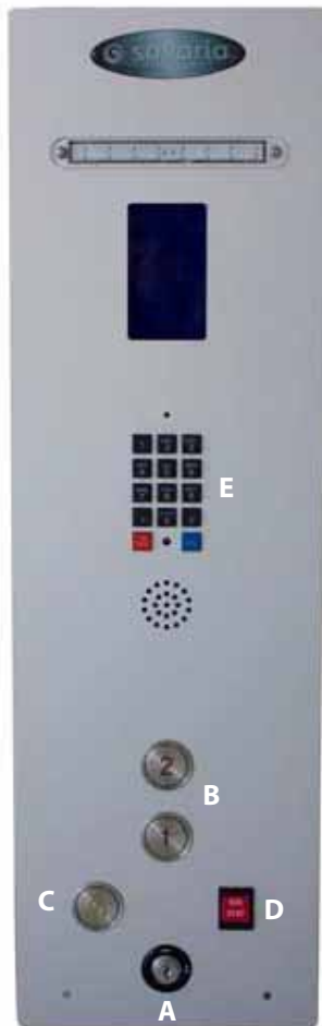
Figure 1: Sample COP

This button can be used at any time to stop the cab and activate the alarm buzzer.