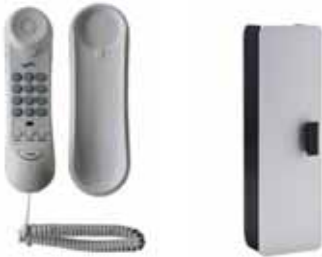
Figure 2: Standard Phone and Phone Box

If the unit has a standard phone, it is located in the cab phone box (see below).